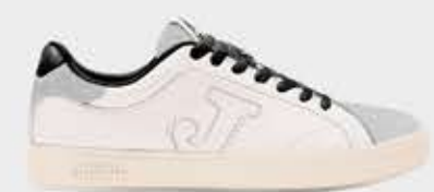
COASIW2501 - 74,99€