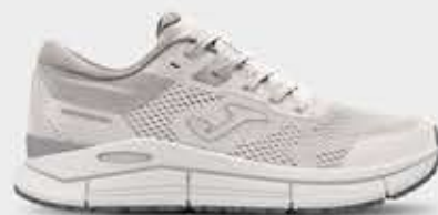
CHEOW2525 - 63,99€