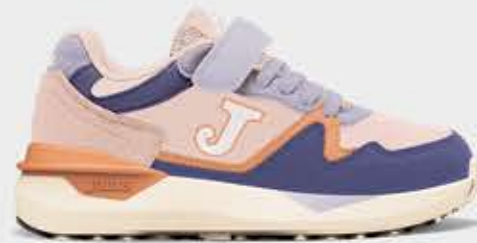
J3080W2519V - 33,99€