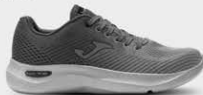
CCORIW2512 - 39,99€