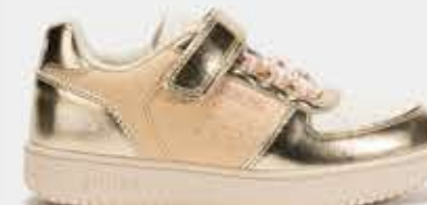
JPIPEW2518V - 32,99€