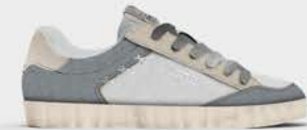
CSUNSLW2512 - 70,99€