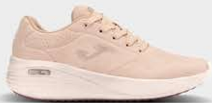
CMINLW2513 - 46,99€