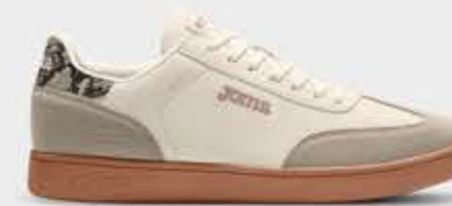
CCCAMLW2525 - 49,99€