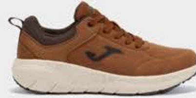
CATOW2526 - 64,99€