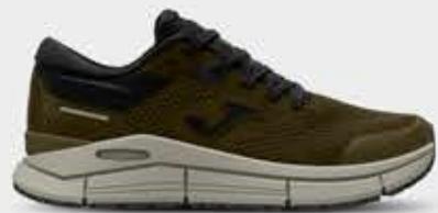
CHEOW2523 - 63,99€