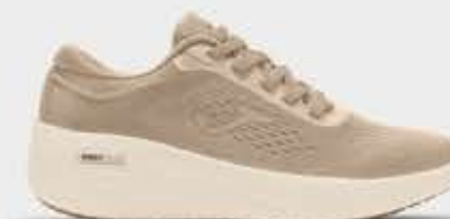
CDIALW2525 - 46,99€