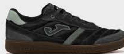
CMUNW2522 - 94,99€