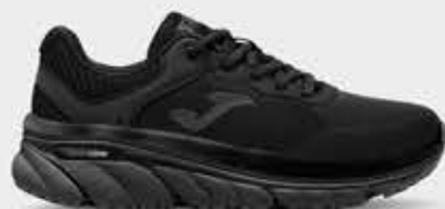
CARILW2501 - 57,99€