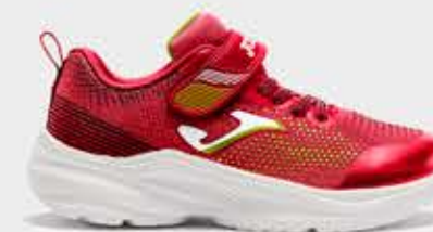
JHORIW2506V - 32,99€