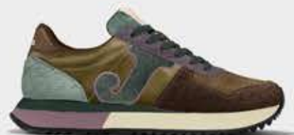
CORIGLW2516 - 74,99€