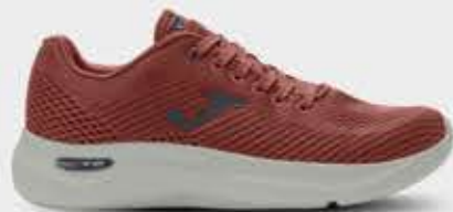
CCORIW2506 - 39,99€