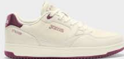
CSTADLW2520 - 49,99€