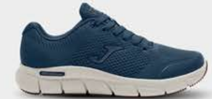
CZENW2533 - 54,99€