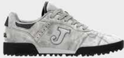
COSLW2501 - 79,99€