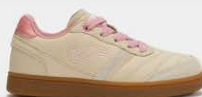
JMUNW2525 - 41,99€