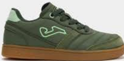
JMUNW2515 - 41,99€