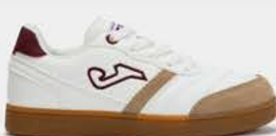
JMUNW2502 - 41,99€