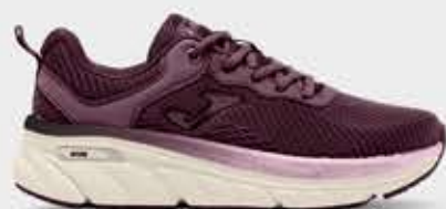
CATELW2520 - 50,99€