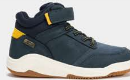
JTORCW2503V - 35,99€