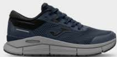
CHEOW2503 - 63,99€