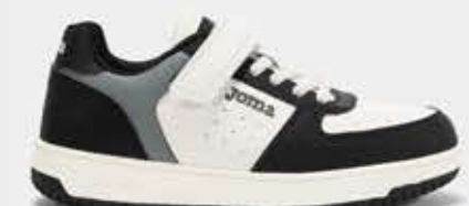
JPIPEW2501V - 32,99€