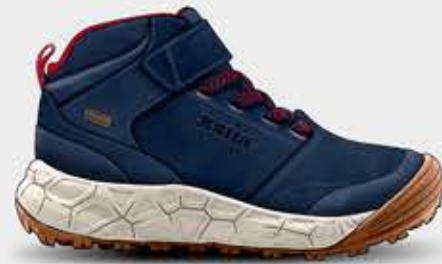
JCAMBW2503V - 39,99€