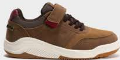
JJARAW2534V - 33,99€