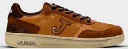
CBOSTW2524 - 74,99€