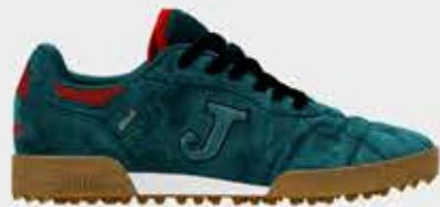
COSLW2515 - 79,99€