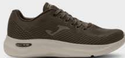
CCORIW2524 - 39,99€