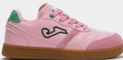
JMUNW2513 - 41,99€