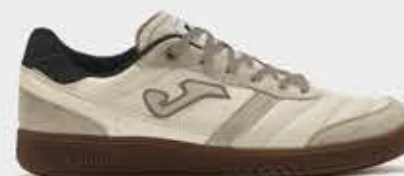
CMUNW2525 - 94,99€