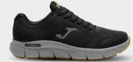
CZENW2521 - 54,99€