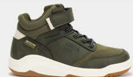
JTORCW2523V - 35,99€