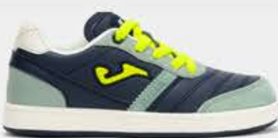
JMUNW2509 - 41,99€