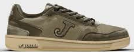
CBOSTW2523 - 74,99€