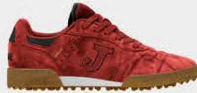
COSLW2506 - 79,99€