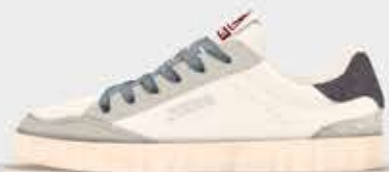
CPAUW2525 - 74,99€