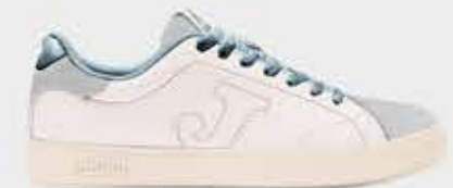
COASILW2527 - 74,99€