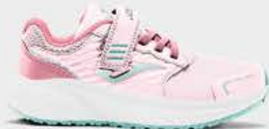
JFURYW2513V - 39,99€