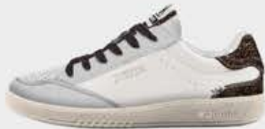
CCALPLW2501 - 70,99€