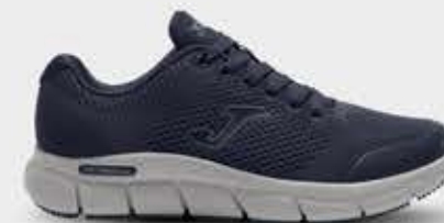
CZENW2503 - 54,99€