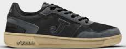
CBOSTW2501 - 74,99€