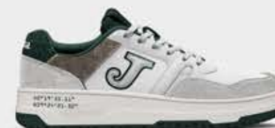
CATTW2515 - 71,99€