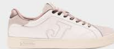
COASILW2529 - 74,99€