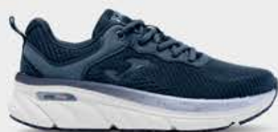
CATELW2503 - 50,99€