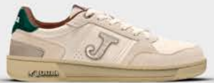
CBOSTW2515 - 74,99€