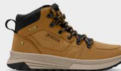
CTORMW2524 - 68,99€