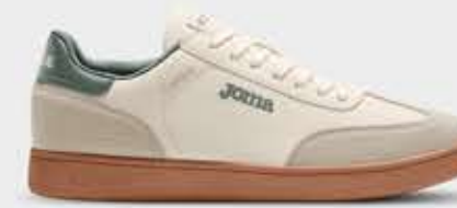
CCAMLW2515 - 49,99€