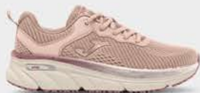
CATELW2529 - 50,99€