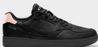
CSTADLW2501 - 49,99€