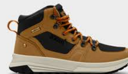
CTORMW2526 - 68,99€