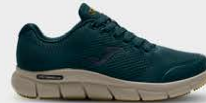
CZENW2517 - 54,99€