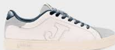
COASIW2503 - 74,99€