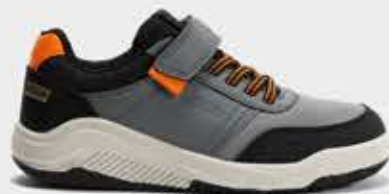
JJARAW2501V - 33,99€

This winter model is ideal for complementing daily looks, ensuring comfort, warmth, and protection for the feet.