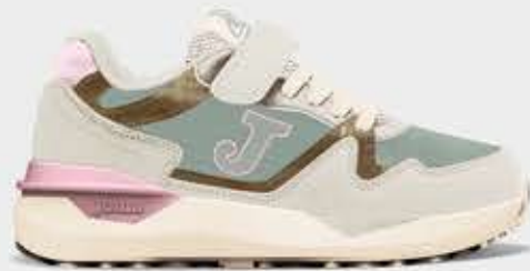
J3080W2535V - 33,99€