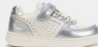
JPIPEW2512V - 32,99€