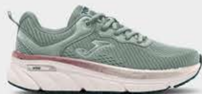
CATELW2517 - 50,99€