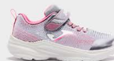
JHORIW2519V - 32,99€