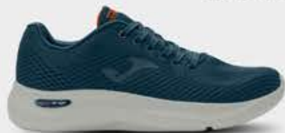
CCORIW2517 - 39,99€