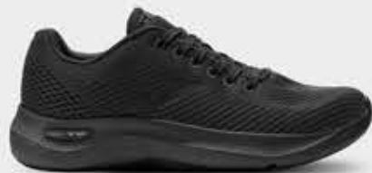
CCORIW2521 - 39,99€