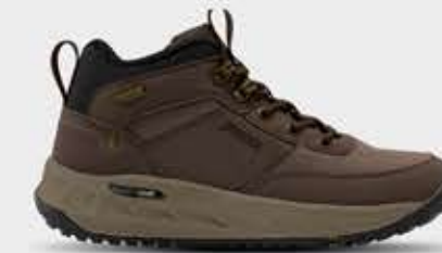
CTERW2524 - 68,99€