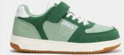
JPIPEW2515V - 32,99€