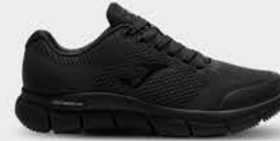
CZENW2521 - 54,99€