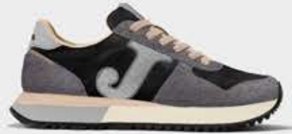
CORIGLW2501 - 74,99€