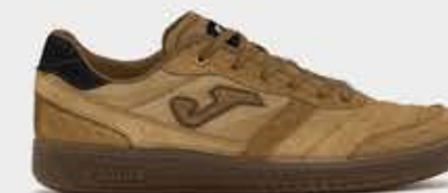
CMUNW2526 - 94,99€