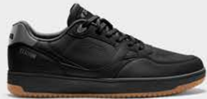
CSTAW2501 - 49,99€