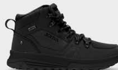
CTORMW2501 - 68,99€