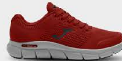
CZENW2506 - 54,99€