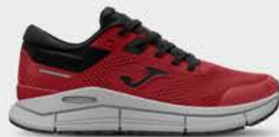
CHEOW2506 - 63,99€