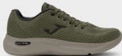
CCORIW2523 - 39,99€