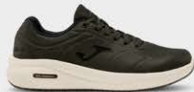
CRAYW2523 - 64,99€