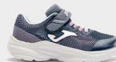
JHORIW2533V - 32,99€