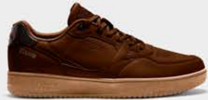
CSTAW2524 - 49,99€