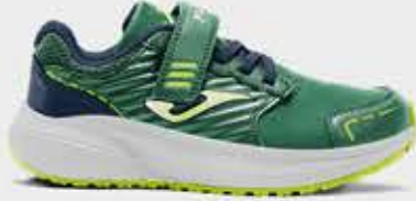
JFURYW2515V - 39,99€