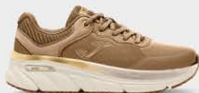
CARILW2526 - 57,99€