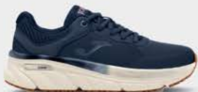
CARILW2503 - 57,99€