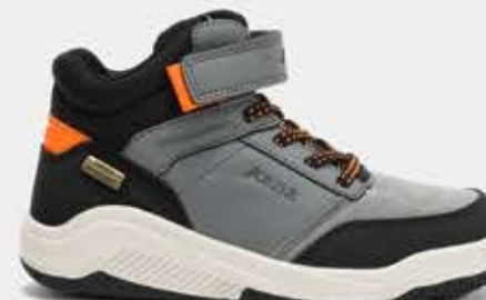
JTORCW2501V - 35,99€