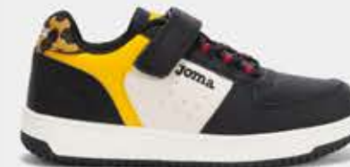
JPIPEW2531V - 32,99€