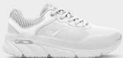
CARILW2502 - 57,99€