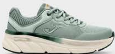
CARILW2515 - 57,99€