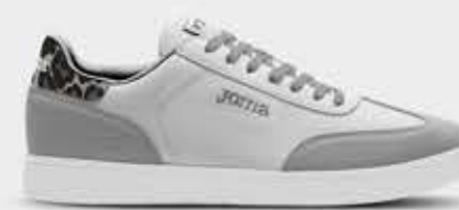
CCAMLW2512 - 49,99€