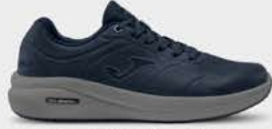
CRAYW2503 - 64,99€