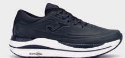
CCARW2503 - 79,99€