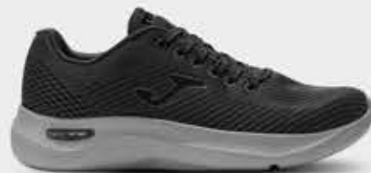
CCORIW2522 - 39,99€