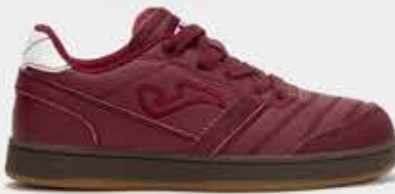
JMUNW2510 - 41,99€