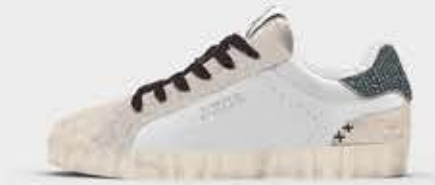
CALBALW2501 - 70,99€