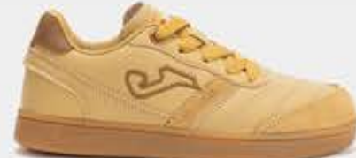
JMUNW2526 - 41,99€