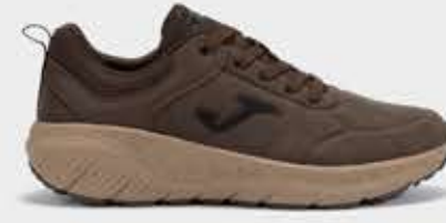
CATOW2524 - 64,99€