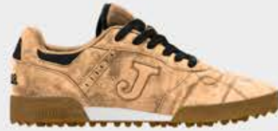
COSLW2526 - 79,99€