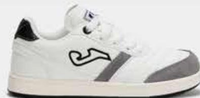
JMUNW2532 - 41,99€