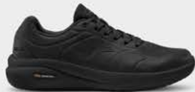
CRAYW2521 - 64,99€