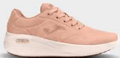
CMINLW2526 - 46,99€