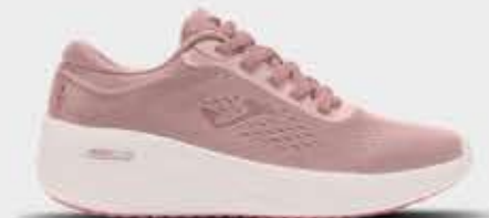
CDIALW2539 - 46,99€