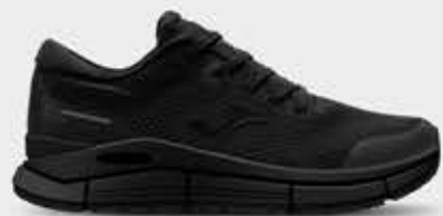
CHEOW2521 - 63,99€