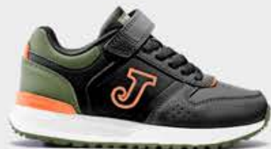
JTORW2531V - 28,99€