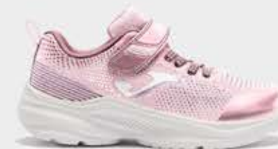
JHORIW2513V - 32,99€