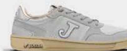
CBOSTLW2512 - 74,99€