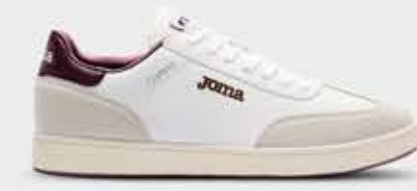
CCAMLW2502 - 49,99€