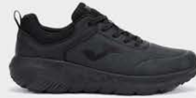
CATOW2501 - 64,99€