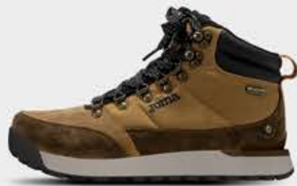
CTALW2526 - 68,99€