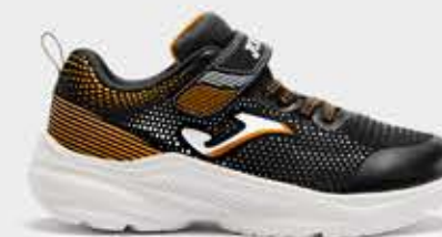
JHORIW2501V - 32,99€