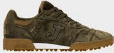
COSLW2523 - 79,99€