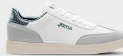
CCAMLW2517 - 49,99€