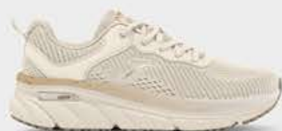
CATELW2525 - 50,99€