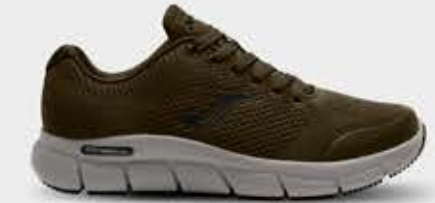
CZENW2523 - 54,99€