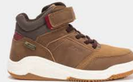
JTORCW2534V - 35,99€