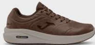
CRAYW2526 - 64,99€