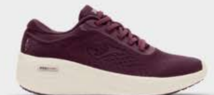
CDIALW2519 - 46,99€