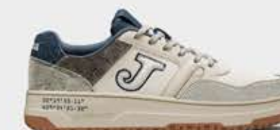
CATTW2526 - 71,99€