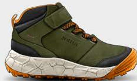
JCAMBW2523V - 39,99€