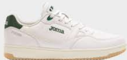
CSTADLW2515 - 49,99€