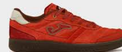
CMUNW2506 - 94,99€