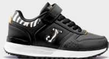
JTORW2541V - 28,99€