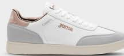
CCAMLW2529 - 49,99€