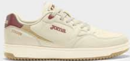
CSTADLW2526 - 49,99€