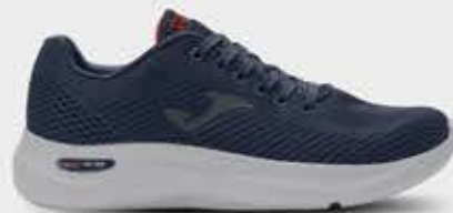
CCORIW2503 - 39,99€