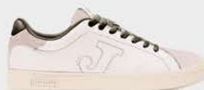
COASIW2523 - 74,99€