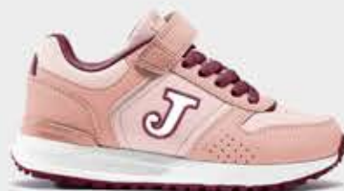
JTORW2529V - 28,99€