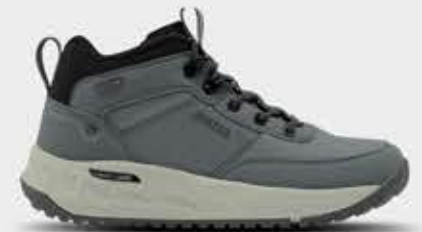
CTERW2512 - 68,99€