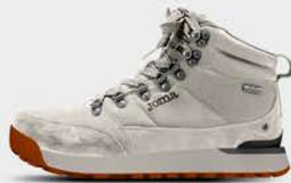
CTALW2525 - 68,99€