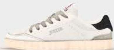
CPAUW2501 - 74,99€