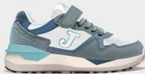
J3080W2505V - 33,99€