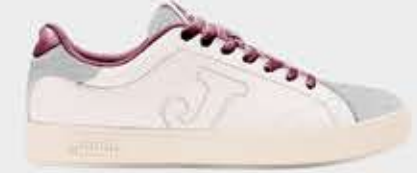
COASILW2520 - 74,99€