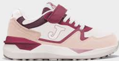
J3080W2520V - 33,99€