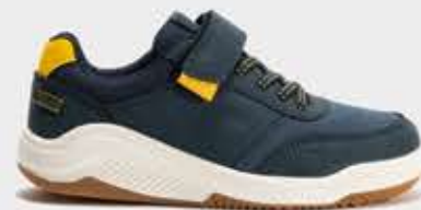
JJARAW2503V - 33,99€