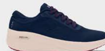
CDIALW2503 - 46,99€