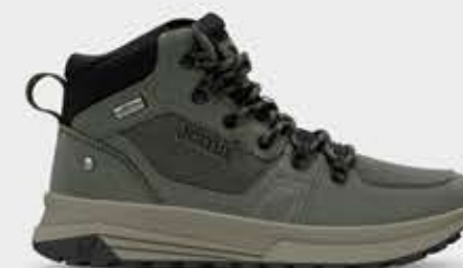
CTORMW2523 - 68,99€