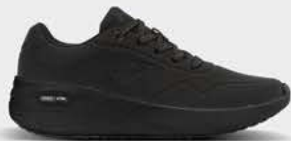
CMINLW2501 - 46,99€