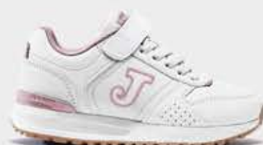
JTORW2532V - 28,99€