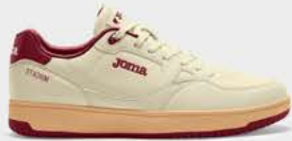
CSTAW2520 - 49,99€