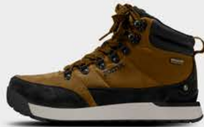
CTALW2524 - 68,99€