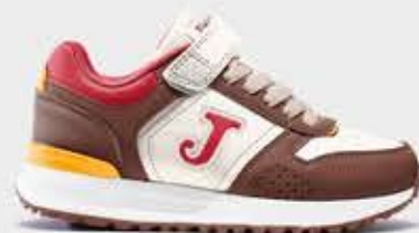
JTORW2524V - 28,99€