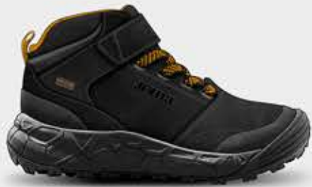
JCAMBW2501V - 39,99€