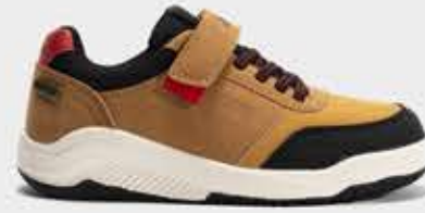
JJARAW2524V - 33,99€