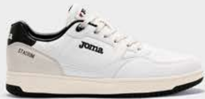
CSTAW2502 - 49,99€