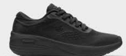
CDIALW2501 - 46,99€