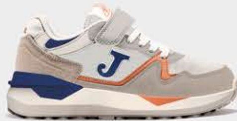
J3080W2525V - 33,99€