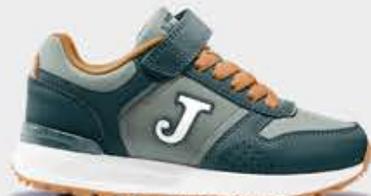
JTORW2523V - 28,99€