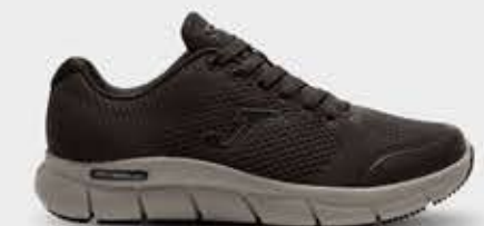
CZENW2525 - 54,99€