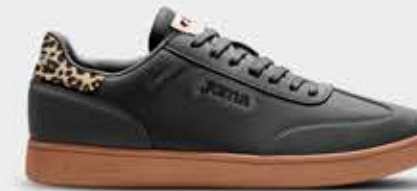
CCAMLW2501 - 49,99€