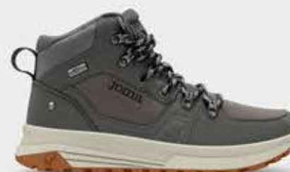
CTORMW2512 - 68,99€