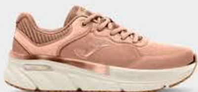
CARILW2529 - 57,99€