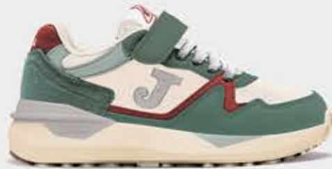
J3080W2515V - 33,99€