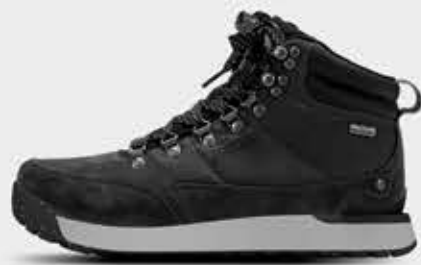
CTALW2501 - 68,99€