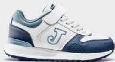
JTORW2502V - 28,99€