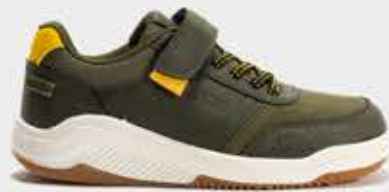
JJARAW2523V - 33,99€