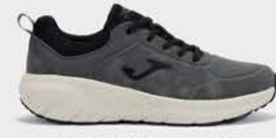
CATOW2512 - 64,99€