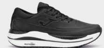
CCARW2501 - 79,99€