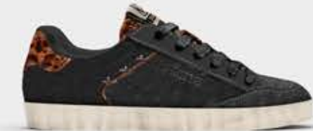
CSUNSLW2531 - 70,99€