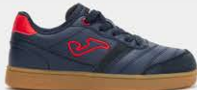
JMUNW2503 - 41,99€