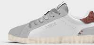
CALBALW2520 - 70,99€