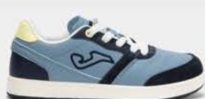
JMUNW2533 - 41,99€