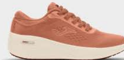
CDIALW2529 - 46,99€