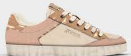
CSUNSLW2529 - 70,99€