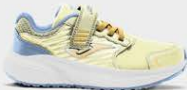
JFURYW2528V - 39,99€