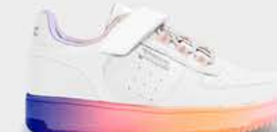
JPIPEW2516V - 32,99€