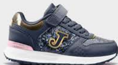
JTORW2533V - 28,99€