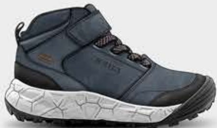
JCAMBW2503V - 39,99€