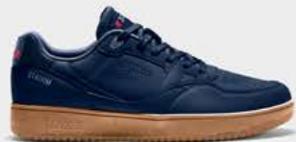
CSTAW2503 - 49,99€