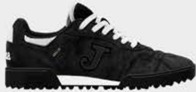
COSLW2521 - 79,99€