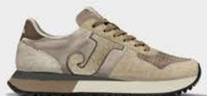
CORIGLW2524 - 74,99€