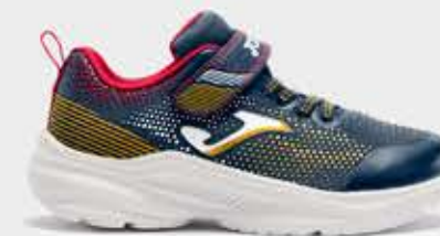
JHORIW2503V - 32,99€