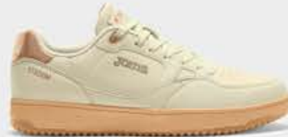
CSTADLW2525 - 49,99€