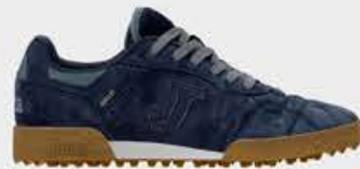
COSLW2503 - 79,99€