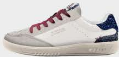
CCALPLW2503 - 70,99€