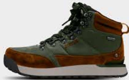
CTALW2523 - 68,99€