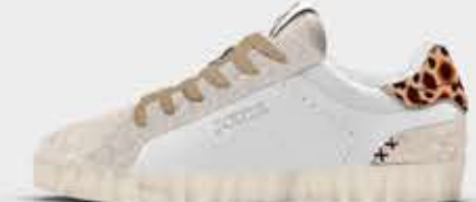
CALBALW2524 - 70,99€