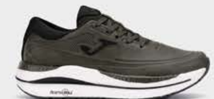
CCARW2523 - 79,99€