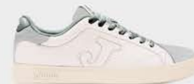
COASILW2515 - 74,99€