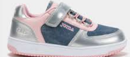
JPIPEW2505V - 32,99€