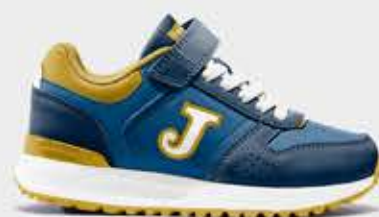
JTORW2503V - 28,99€