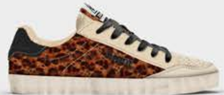
CSUNSLW2524 - 70,99€