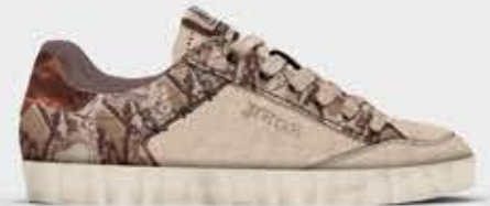
CSUNSLW2526 - 70,99€