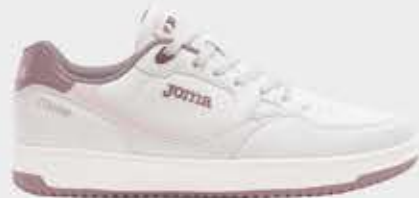
CSTADLW2529 - 49,99€