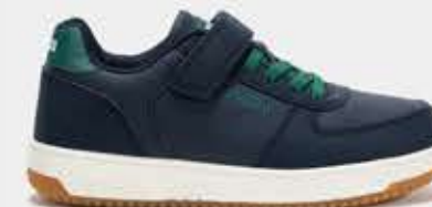
JPIPEW2503V - 32,99€