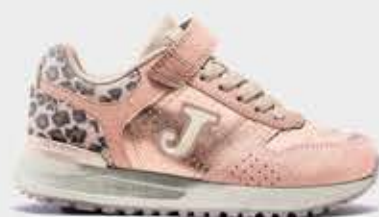
JTORW2513V - 28,99€