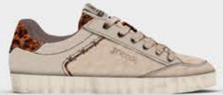
CSUNSLW2525 - 70,99€