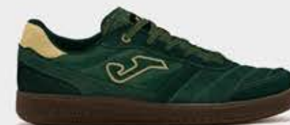
CMUNW2515 - 94,99€