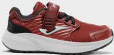
JFURYW2506V - 39,99€