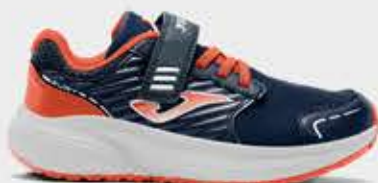
JFURYW2503V - 39,99€