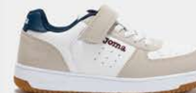
JPIPEW2502V - 32,99€