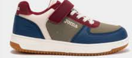
JPIPEW2520V - 32,99€