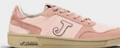
CBOSTLW2529 - 74,99€

The upper is made from leather and suede, a combination of flexible, highly durable, and stylish materials, equipped with the VTS ventilation system. The leather insole is more breathable and resistant to abrasion. The translucent sole is made from DURABILITY rubber.