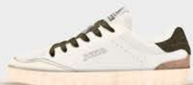
CPAUW2515 - 74,99€