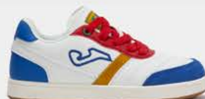
JMUNW2516 - 41,99€