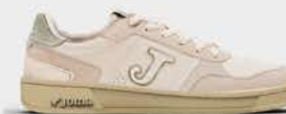
CBOSTLW2518 - 74,99€