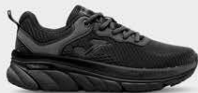
CATELW2501 - 50,99€