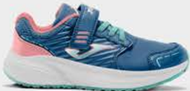
JFURYW2533V - 39,99€