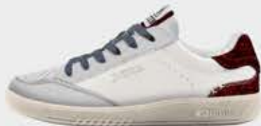
CCALPLW2520 - 70,99€