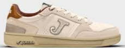
CBOSTW2526 - 74,99€