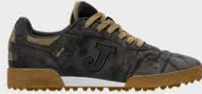
COSLW2522 - 79,99€