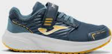
JFURYW2505V - 39,99€