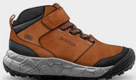
JCAMBW2524V - 39,99€