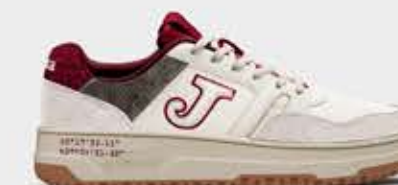
CATTW2506 - 71,99€