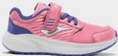
JFURYW2519V - 39,99€