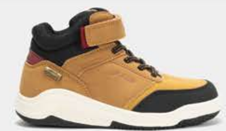
JTORCW2524V - 35,99€