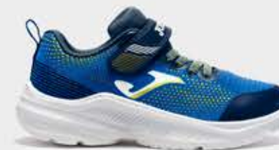
JHORIW2504V - 32,99€