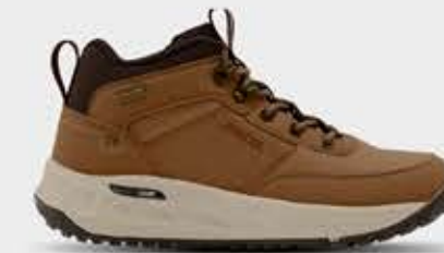
CTERW2526 - 68,99€