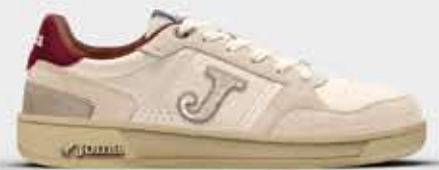
CBOSTW2506 - 74,99€