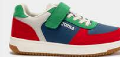
JPIPEW2506V - 32,99€