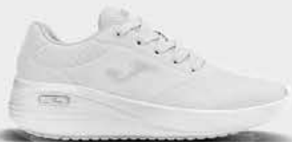
CMINLW2502 - 46,99€