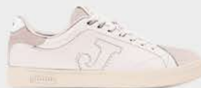
COASIW2525 - 74,99€