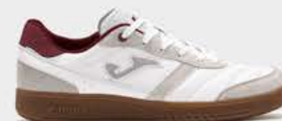
CMUNW2501 - 94,99€