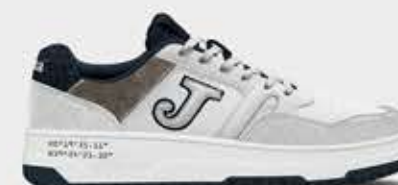
CATTW2523 - 71,99€