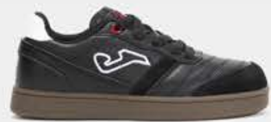
JMUNW2501 - 41,99€