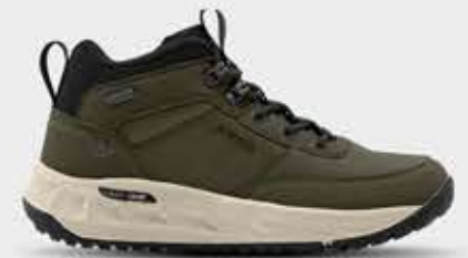
CTERW2523 - 68,99€