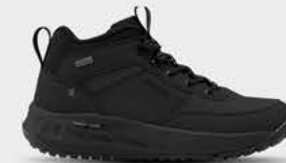
CTERW2501 - 68,99€