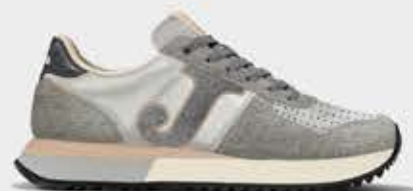
CORIGLW2512 - 74,99€