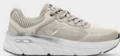
CARILW2512 - 57,99€