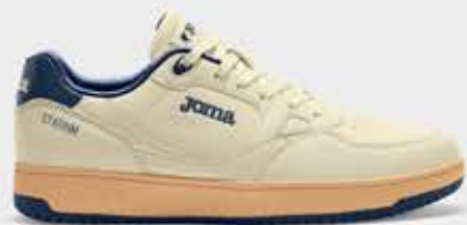
CSTAW2525 - 49,99€