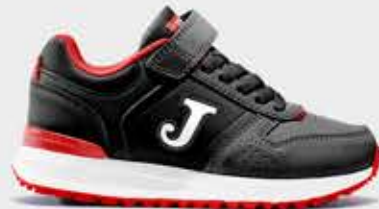
JTORW2501V - 28,99€