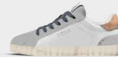
CALBALW2529 - 70,99€