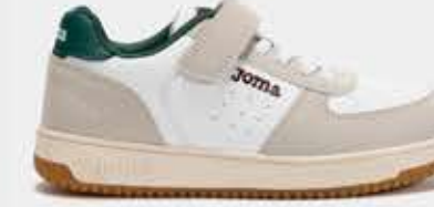
JPIPEW2525V - 32,99€